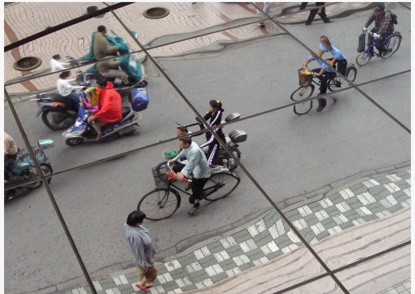
Better times ahead for Chinese IPOs in the United States?

EIN News has developed one of the world's leading real time news indexing services. Its systems continuously scan the web, indexing news from thousands of worldwide sources. The data is then filtered according to specific needs, and the processes are supervised by a team of