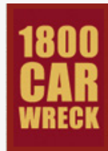
1800 Car Wreck