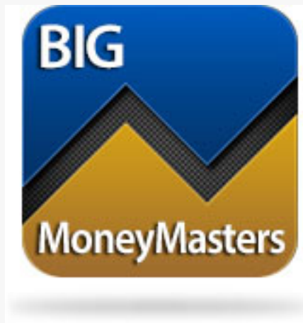
Big Money Masters

Big Money Masters is a full trading course, designed to help and assist Forex traders, irrespective of their expertise level. The videos will reveal how BMM works in the real Forex market and also teaches how the users can benefit from the knowledge provided by the modules. This trading course has seven modules covered in over 15 hours of content including audios, transcripts, live