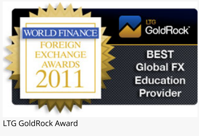
LTG GoldRock Award