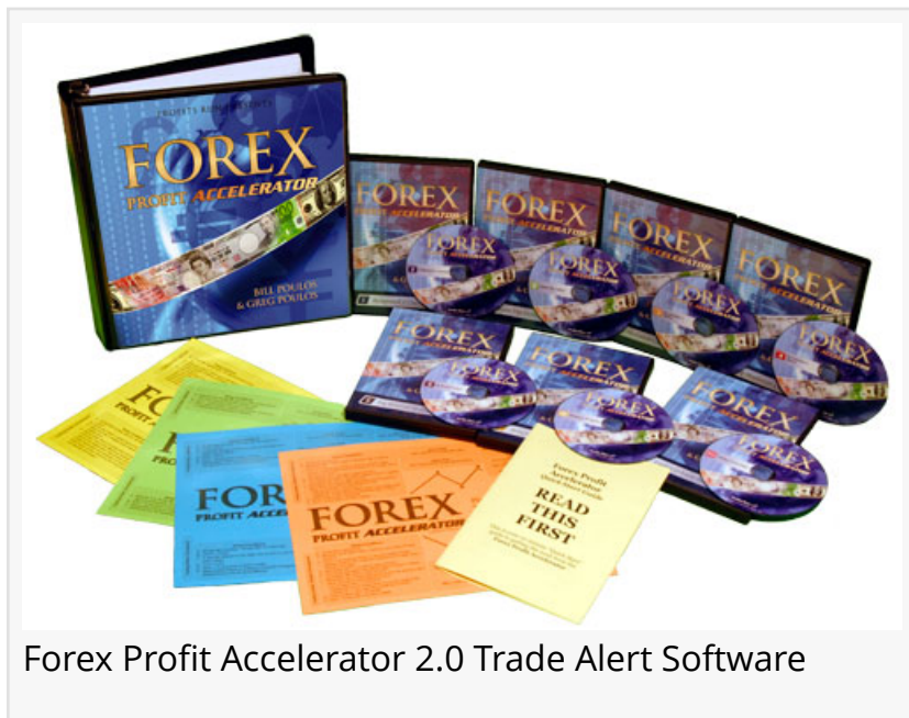
Forex Profit Accelerator 2.0 Trade Alert Software

The many forex traders who have used Forex Profit Accelerator have great things to say about it. One, it is a complete method that covers setup conditions, entry, and the rules for stop and exit. Two, it provides a clear guide for managing risks, portfolio's and money. Three, it is based on technical analysis but is not fully computer-reliant. Four, the methods are so easy to master that traders can use only 20 minutes to trade each day.