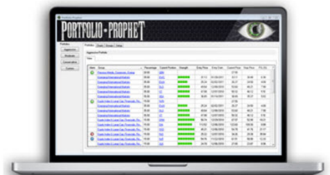
Portfolio Prophet Trade Alert Software