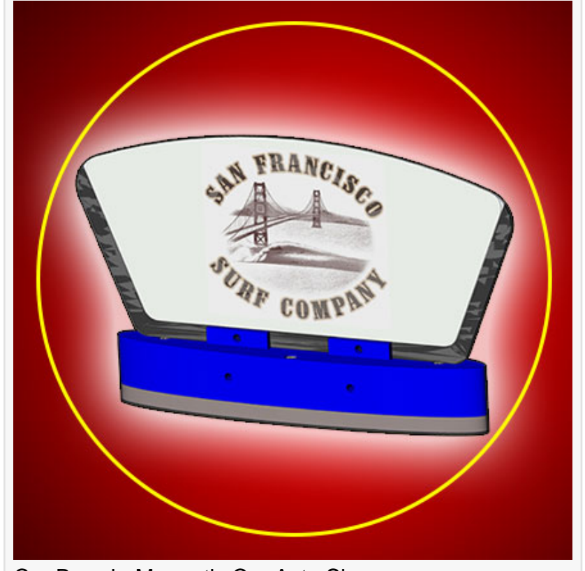
Car Board - Magnetic Car Auto Signs

The Car Board <u>automobile signage</u> can also be used for much more than sports teams. It can be used for business advertisement, product promotion and much more.