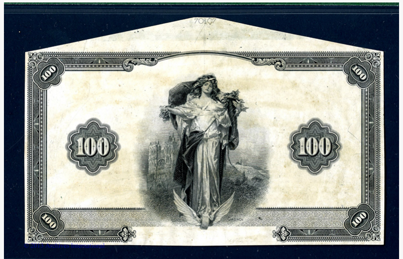
Lot 121 France. Banque De France, ND 1917 Essay Progress Proof

Offered will be additional selections from the Hamtramck Collection assembled by a career military officer over a 50-year period from the 1940s to the 1990s. Also being offered will be Part 1 of the impressive Scarsdale Collection of post-1960 modern Africa high grade issues from many countries on the continent. The auction will feature 600 lots of worldwide banknotes including 240 lots from the Scarsdale Collection of modern Africa; 30 lots from China, which will serve as a warm-up to Archives International Auctions' sale slated for Saturday, April 12 in Hong Kong, China. There will also be more than 120 desirable notes in the U.S. session and over 300 lots of rare and attractive U.S. and foreign certificates in the scripophily session. "We are extremely excited about our upcoming auction schedule,