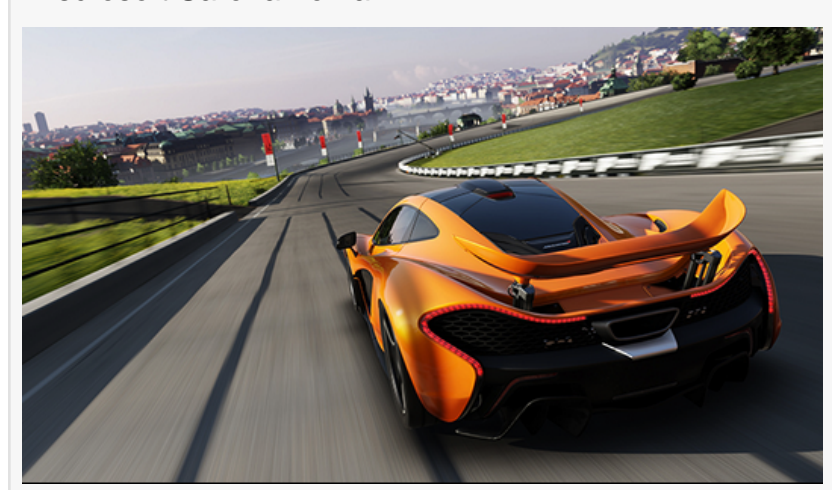
Forza Horizon game

currently available, the game is expected to be part of the tremendous Forza Motorsport franchise from Microsoft.