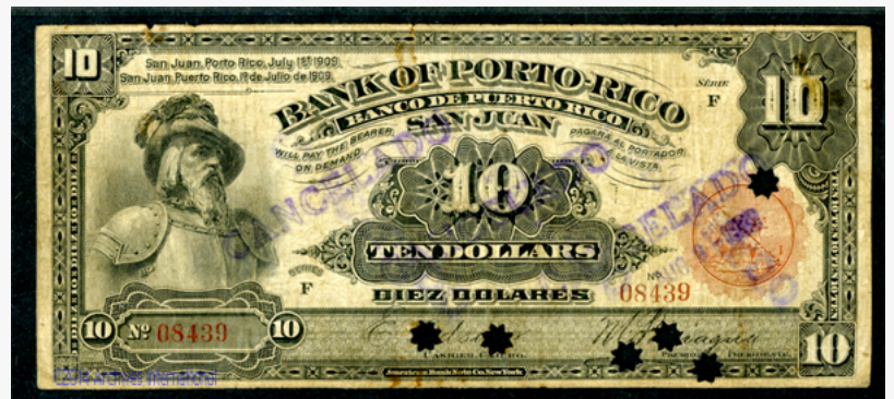
San Juan, Puerto Rico, $10, Series F, P-48b, Issued and punch cancelled banknote, Black with red seal on lower right, back brown, S/N 08439, PMG graded Choice Fine NET with note of foreign substance, rust and small tears, purple "Cancelado" overprints on