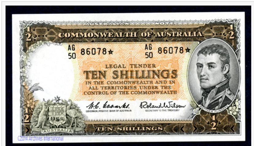
Australia, 1961, 10/- Shillings Star Note, P-33a*, R17S, RA13, Coombs | Wilson, S/N AG/50 86078*, Reserve Bank signature title, "Governor, Reserve Bank of Australia", Watermark; Cook, PMG graded Gem Uncirculated 65 EPQ,

China will be represented with a dozen lots, including an extremely rare Central Bank of China 1949 essay specimen that was only discovered eight years ago in the archives of American Bank Note