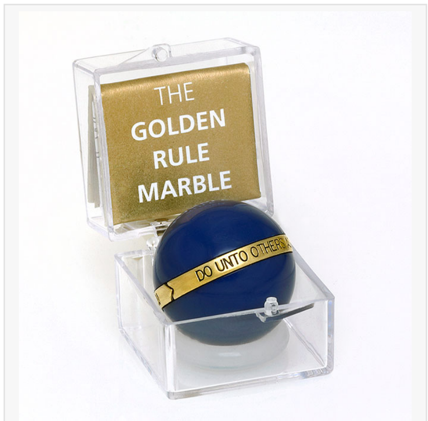
The Golden Rule Marble - gift set with acrylic box and pamphlet enclosure

As part of their own Golden Rule philosophy, Stow-based Vallmar Company has teamed up with Weaver Pro-Pak of Cuyahoga Falls, Ohio for the finishing, assembling and packaging of The Golden Rule Marble™. Weaver Industries is a non-profit organization providing individuals with