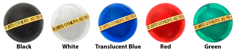
Available in Five Other Tiger Eye Acrylic Colors!