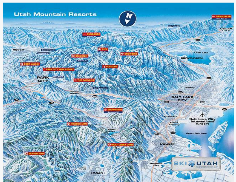
Just 35 minutes from SLC International Airport