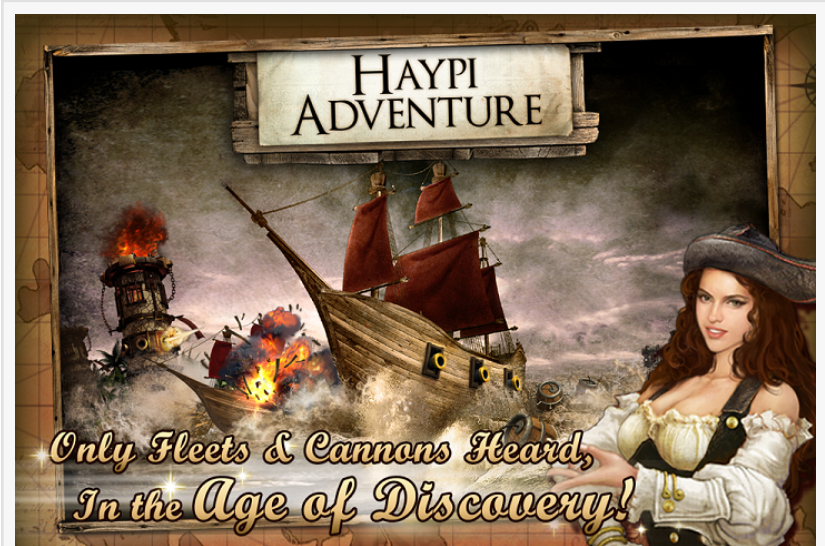
Haypi Adventure: Kingdom of Glory

There is another important piece of news concerning the developer's newest game: Haypi Adventure :