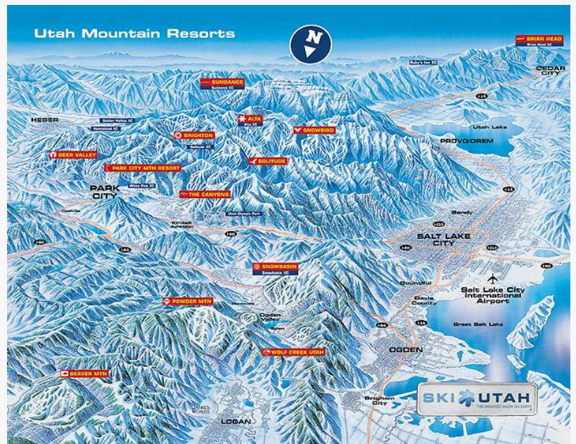
Just 35 minutes from SLC International Airport