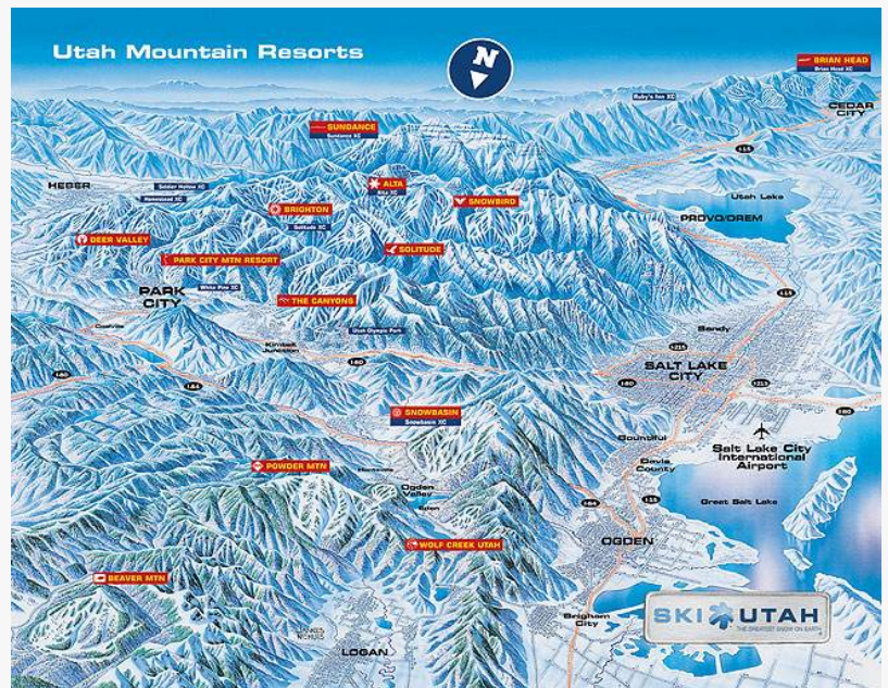
Just 35 minutes from SLC International Airport