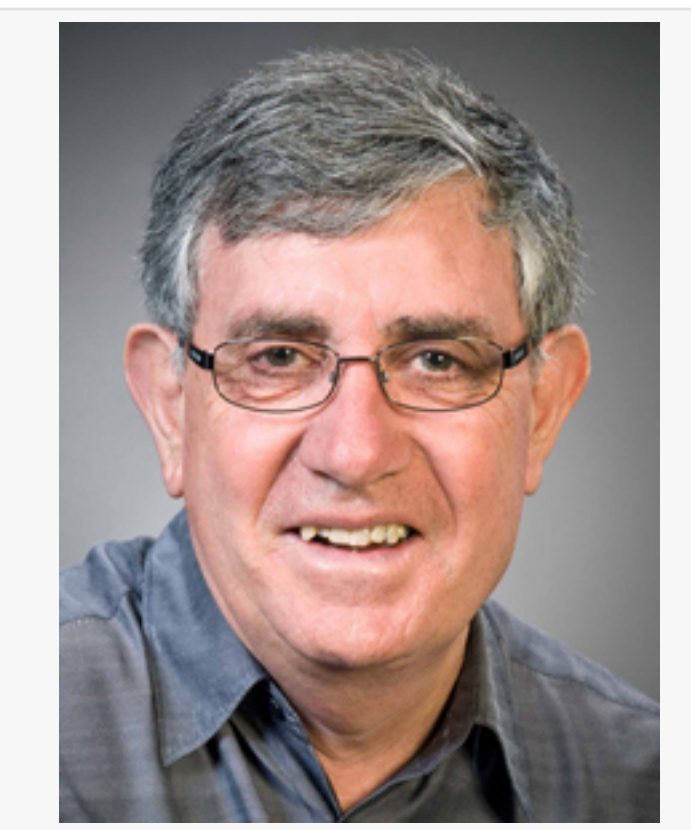
The late Sir Paul Callaghan