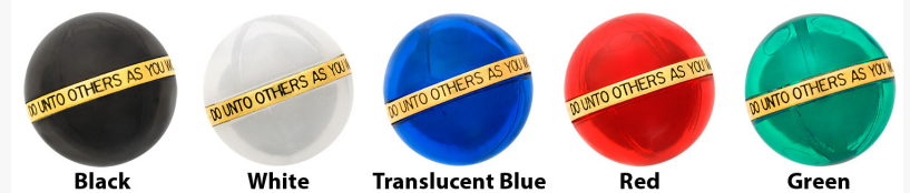
Available in Five Other Tiger Eye Acrylic Colors!