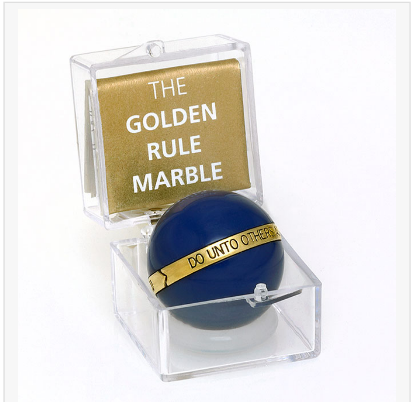
The Golden Rule Marble - gift set with acrylic box and pamphlet enclosure

Nearly 50 years later, Vallmar & Co. was asked by an Akron, Ohio-based company to make 2,000 of the marbles to give as a corporate gift in honor of their 50th anniversary. Vallmar engineered a new version of the marble from a custom-blended cat’s eye acrylic polymer, centered by a stainless steel core. The 1-inch diameter marble, weighing over one ounce, is encircled by a hand-finished brass band inscribed with the Golden Rule.