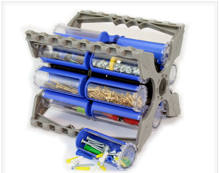
16 Tube Cube with various products

Stretch goals will include producing his products in new colors and offering add on items to help supporters customize their rewards. In addition, a new Industrial strength Tube Cube will be offered for the Large Twist Tubes. This Rotary Tube System will include 16 Large Stortech Tubes in an aluminum frame that is strong enough for industrial and professional contractors.