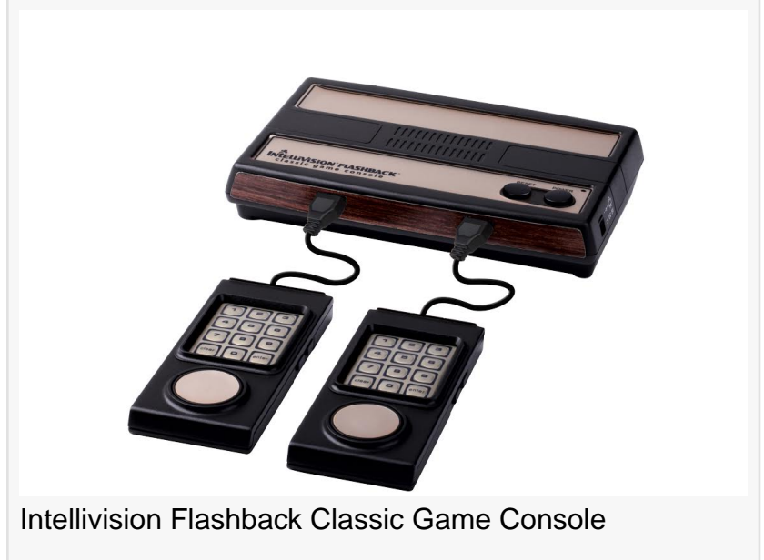
Intellivision Flashback Classic Game Console

This year's Classic Gaming Expo will be the largest in its 15-year history, including a 7,000 square foot museum of historical and rare videogame artifacts and memorabilia. Attendees are made up of retro-videogame players, collectors, bloggers and reviewers. They can take part in new product