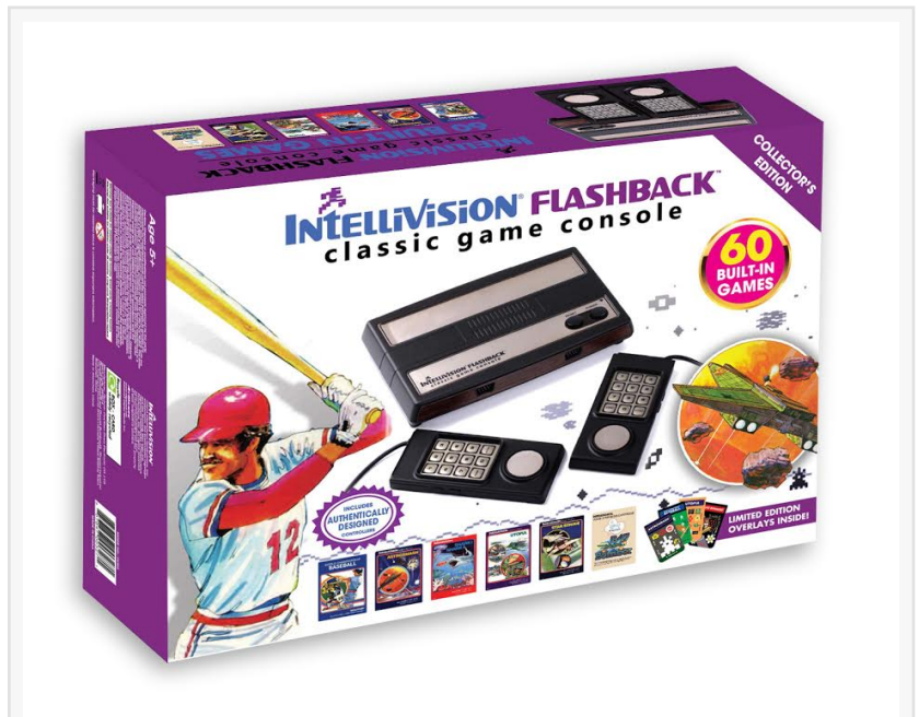
Intellivision Flashback Retail Packaging

The Intellivision Flashback includes 60 classic games built-in, including hits such as Astromash, Utopia, Shark! Shark! and B-17 Bomber, as well as the best-selling Intellivision sports titles and some previously unreleased games. The Flashback easily plugs into most televisions using a standard RCA connector. It is an affordable piece of video gaming nostalgia suitable for the whole family.