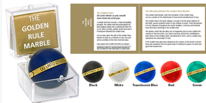
The Golden Rule Marble - available in 6 colors!