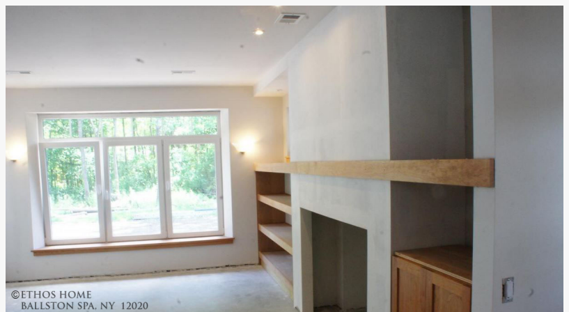
© ETHOS HOME BALLSTON SPA, NY 12020