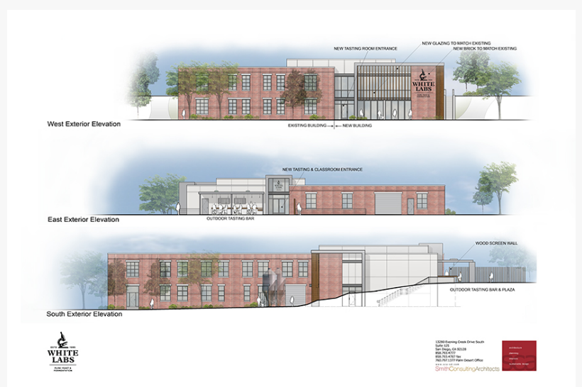
New location renderings for White Labs.