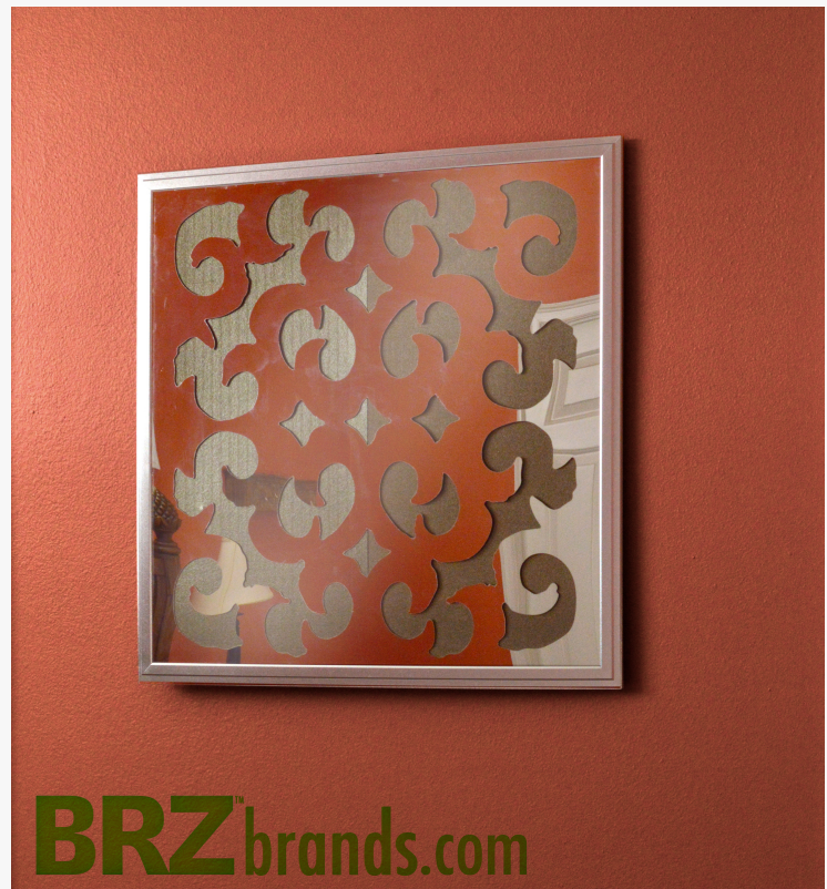
Hot Mirror can be customized to fit your taste