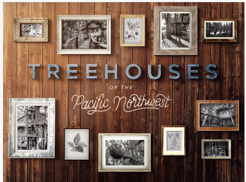
Official Selection APP Category