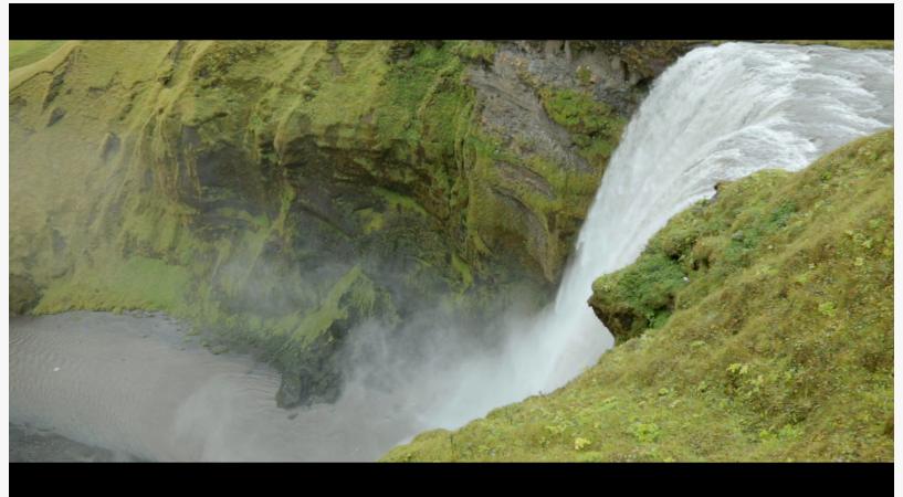
Official Selection Documentary Category