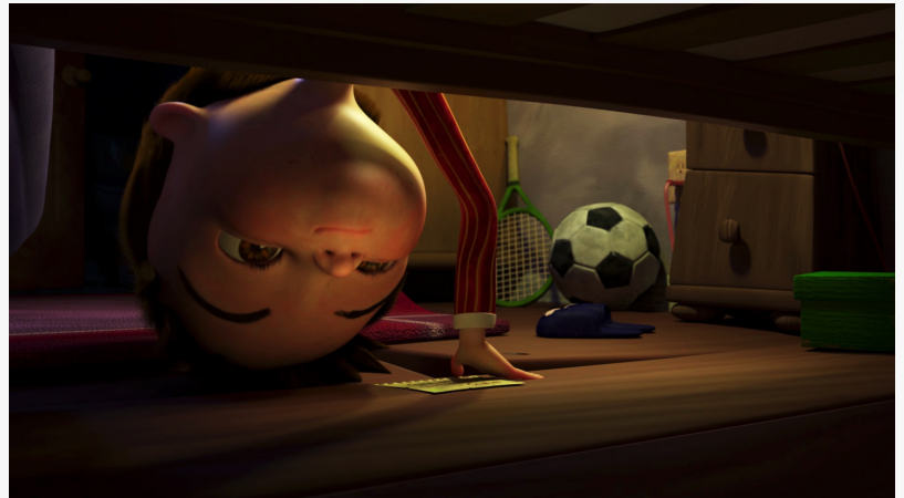
Official Selection Animation Category