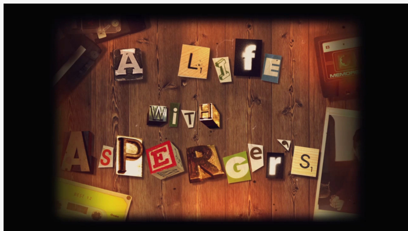
Official Selection Animation Category