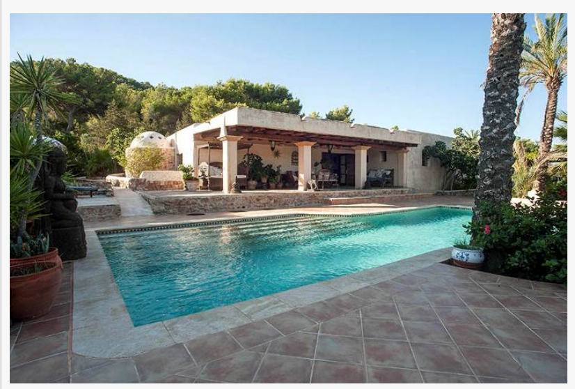
Villa Sabina Ibiza