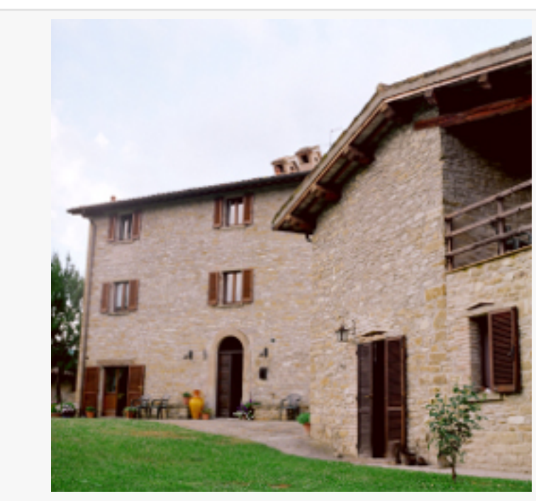
La Tavola Marche

The secluded property consists of a large stone farmhouse over 300 years old and cassette (small side house), an outdoor kitchen with a wood-fired oven and grill, and a tranquil mineral water swimming pool. The property is beautifully restored in the traditional way with wood-beam ceilings, tile floors, numerous fireplaces, and a large open kitchen and dining