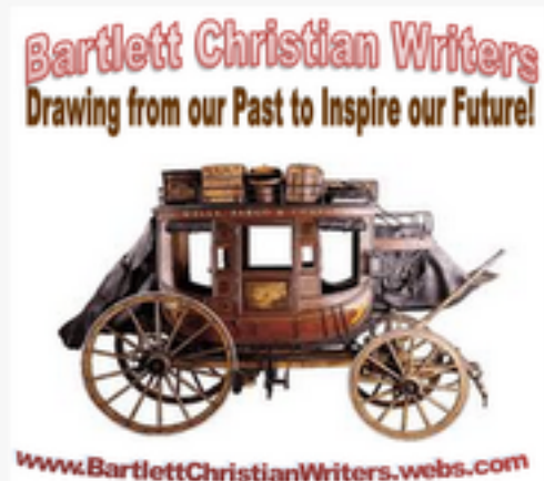
Drawing from the past to inspire the future