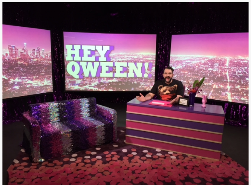
Hey Qween Season 3