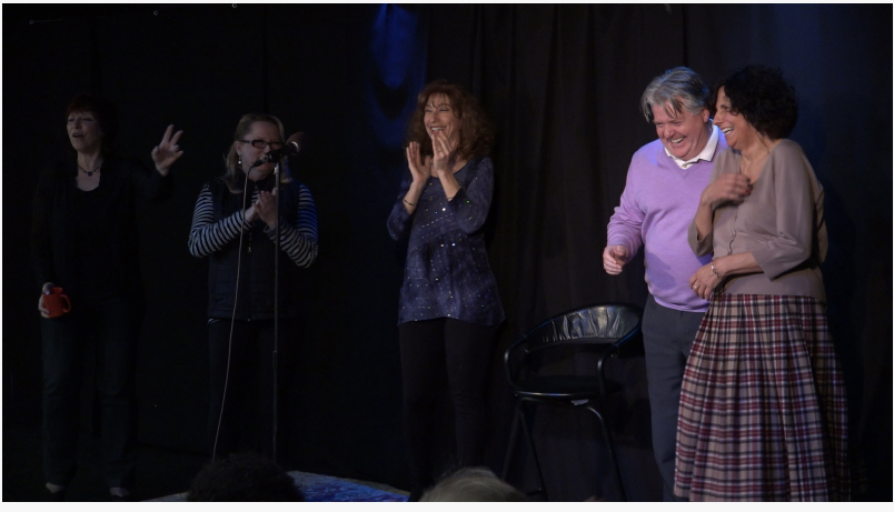
Storytellers onstage March 21, 2015