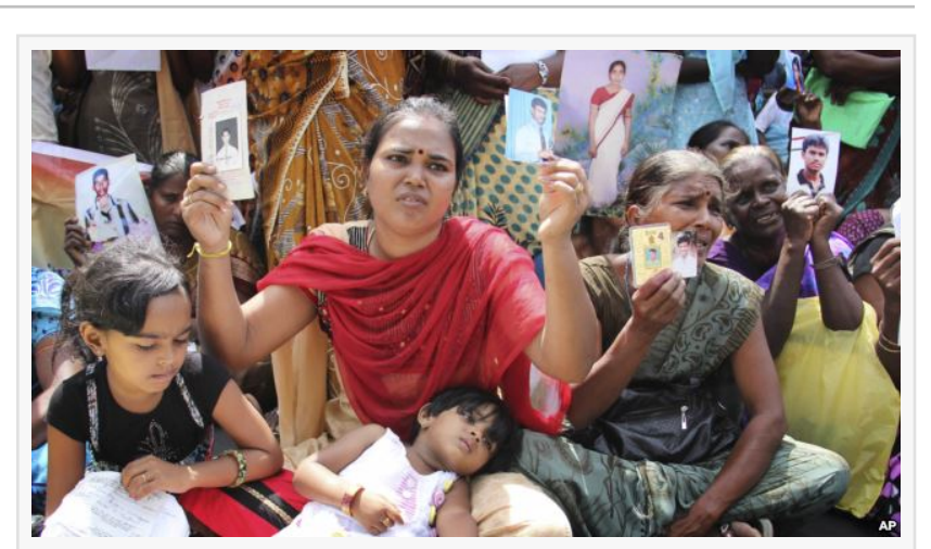
Families of the disappeared

"Sirisena is hardly a beacon of hope for the Tamils: he was acting as defense minister in the