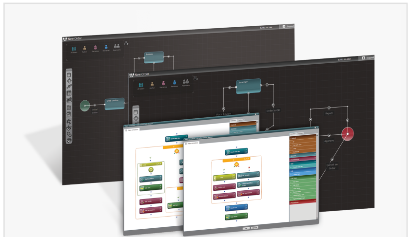
Drag and drop designer to model a process and create a workflow

Other improvements of the 4.2 release include workflow documentation generator, XML parsing