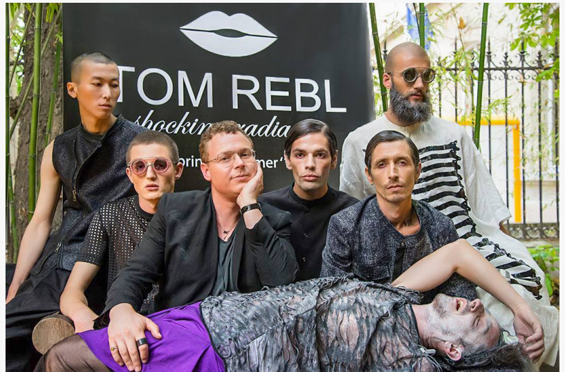
A pose in the garden at La Pagode Etoile in Paris, after party

Costumes, it goes without saying, were studied by Tom Rebl with masterfulness and class. Each