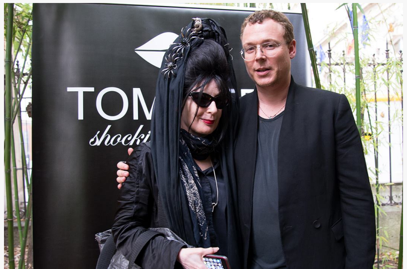
DADAMatix Spring Summer 2016 collection by Tom Rebl