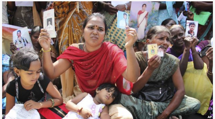
Tamil Families of the disappeared