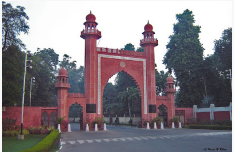
First Muslim University in the world to teach science and math