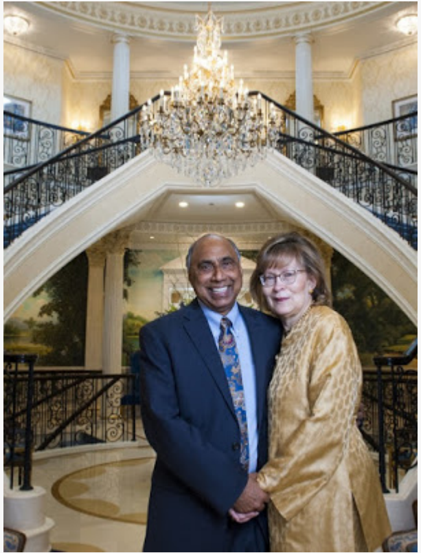
The Man committed to prosperity of India

What does it take to change the world for better? Nothing but a strong commitment of