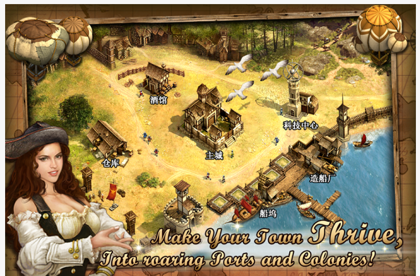
Haypi Adventure: Kingdom of Glory

shield is gone. Territories in mist can only be attacked through using "Find a Target". With new looks, new features and new thrill, Haypi Adventure is a fun challenge for the Haypi fans.