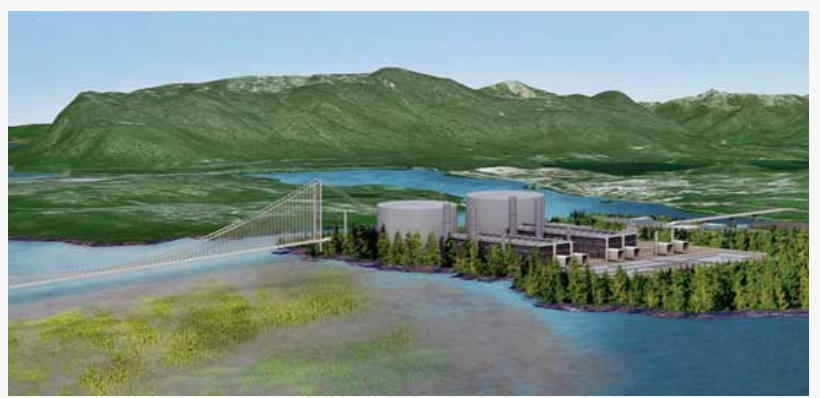
Prince Rupert, Lelu Is. Petronas

The project, which includes a $2 million investment from Western Economic