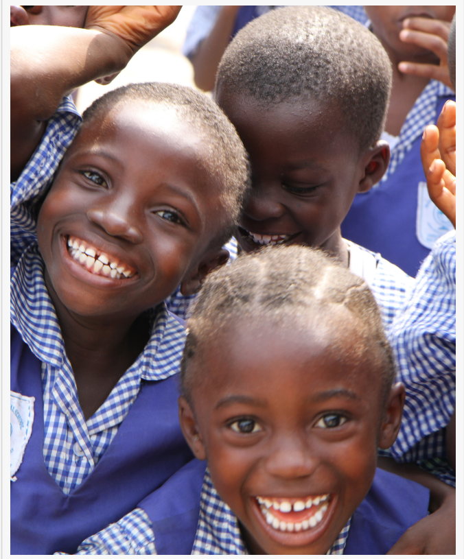
Students at The Hope Project School in Liberia, Africa.

The goal of The Hope Project is to help end the cycle of poverty in Liberia by providing a tuition-free, Pre-K through 12th grade school where children who otherwise couldn't afford an education can go to school, graduate with a high school diploma, and go beyond to get a job, support their family and contribute to the regrowth of their country. In this way The Hope Project School is providing a future of dignity and hope for the 1,200 children and families in Liberia and investing in the future leaders of Africa.