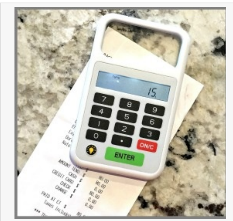
Product magnifies small print and lights up menu and bill

Connie Inukai Tip n Split Solutions 3018693445 email us here