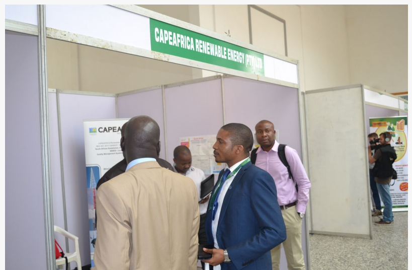
Exhibitors at NAEE