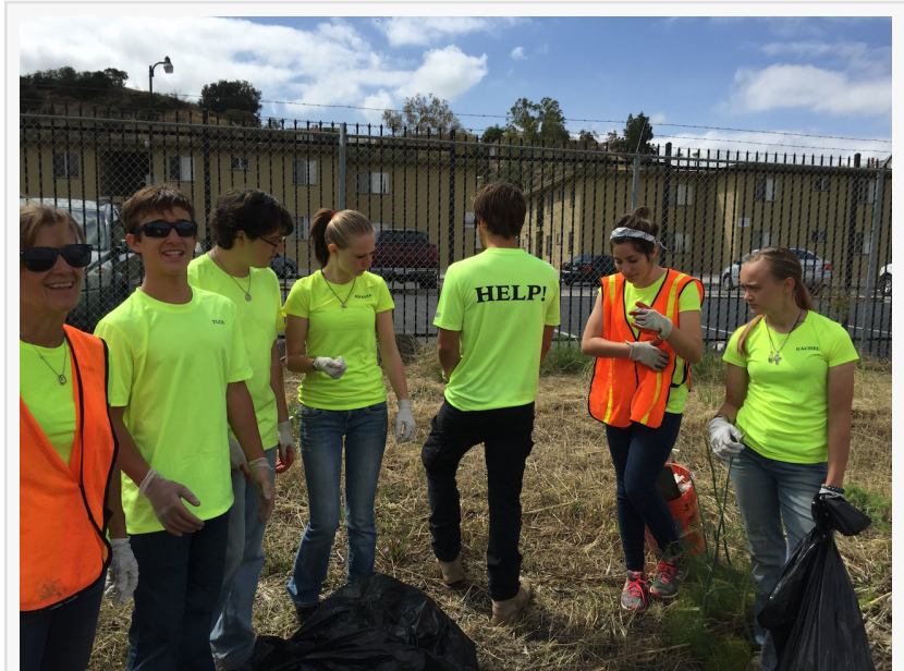
Cleaning up a city street in San Diego, CA.

Now, Help! is preparing to launch their world tour and Australia - the Land Down Under, is the beneficiary of this talented group of acrobats and actors. It is quality entertainment with a moral, gospel message. Imagine a show as big as Circue Du Soleil — but Free in your city!