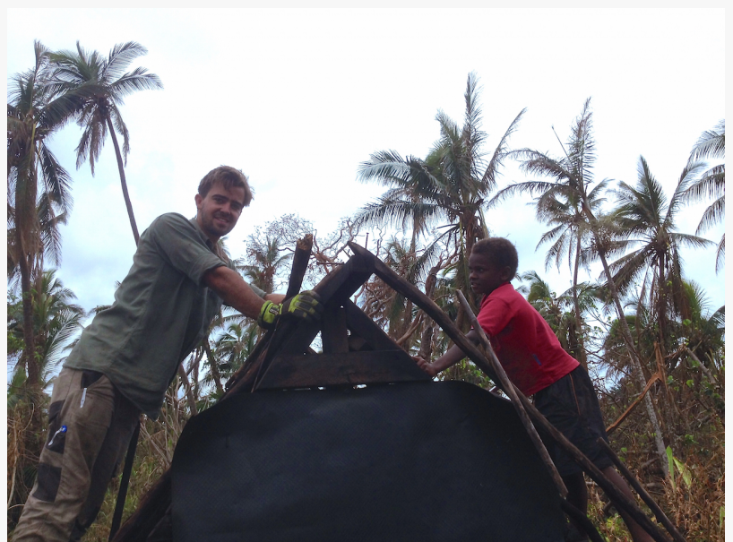
dismantling a home following Cyclone Pam