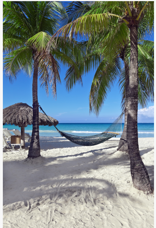
Jamaica bEACH vIEW