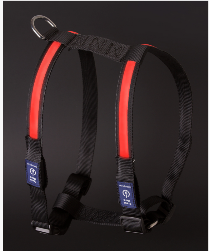
ILLUMINIGHT Ultra Harness (RED)

No maintenance is required outside of recharging.- All products can be seen from more than 1,500 feet away.- Every product is made with rugged, water resistant materials.