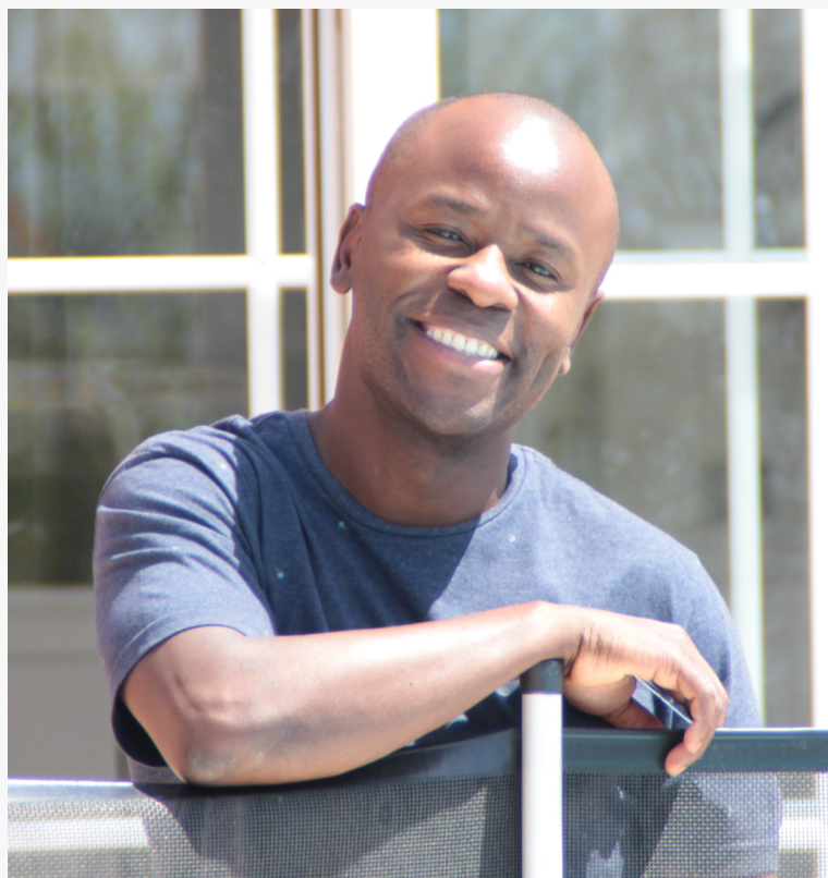
Director, Nairobi Chamber Chorus