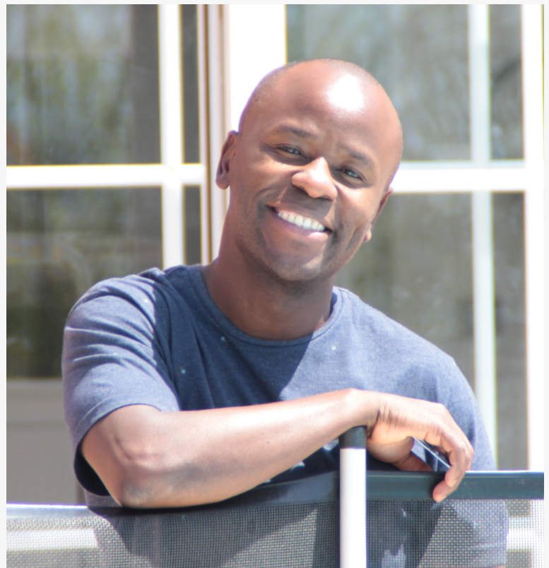
Director, Nairobi Chamber Chorus