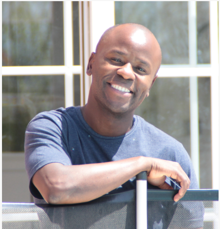
Director, Nairobi Chamber Chorus