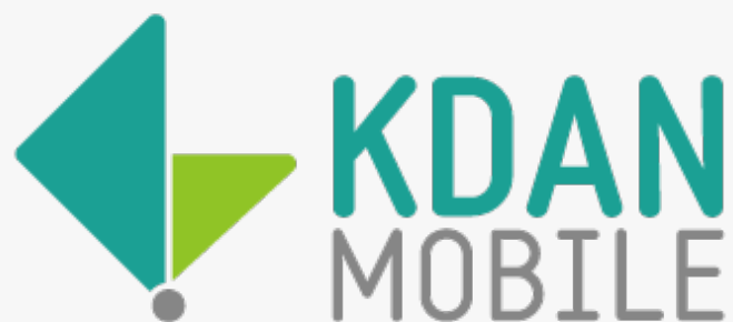
Kdan Mobile Logo