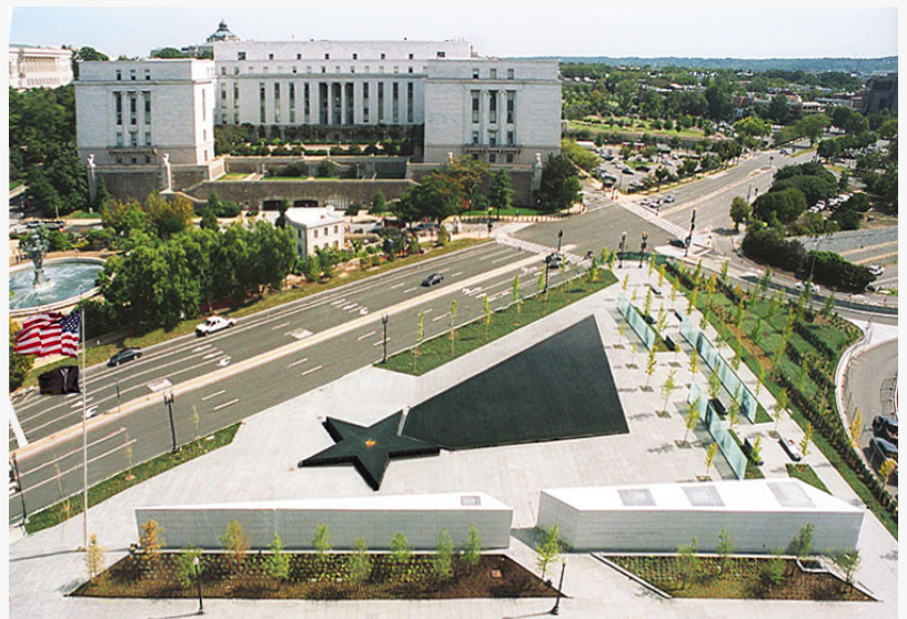
American Veterans Disabled for Life Memorial