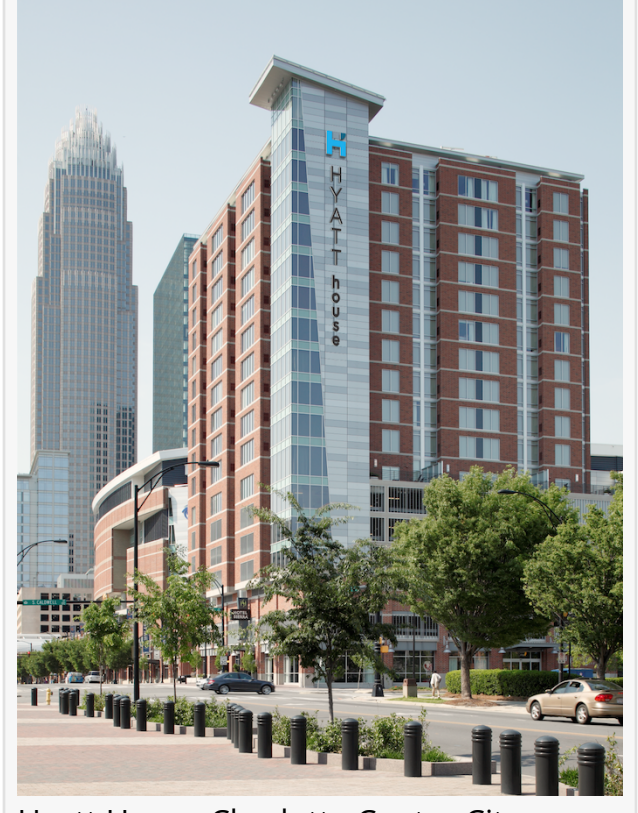
Hyatt House Charlotte Center City

Early team signers for the Uptown Charlotte leap